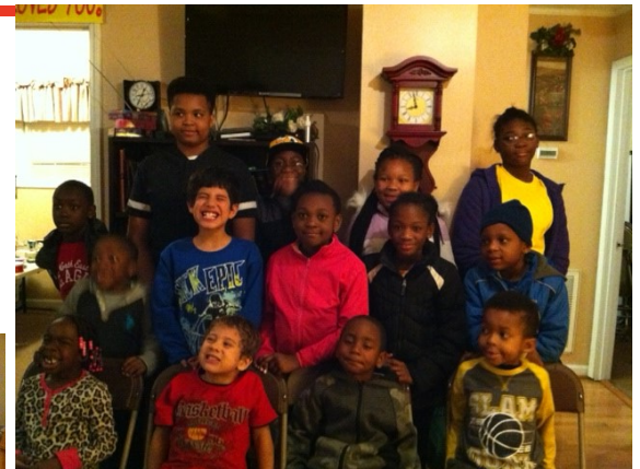
Thank you from the children of the Hope House Homework and Mentoring group!