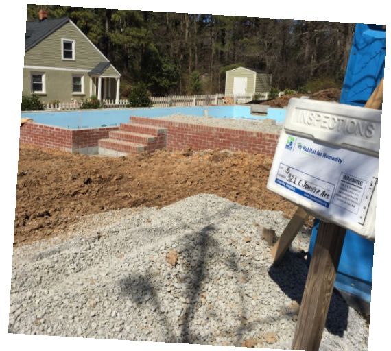
The foundation has been completed!