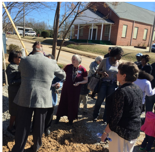
Ground Blessing Ceremony